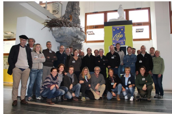
WAG members at the 8th « Wolf Alpine Group » Workshop, 2015 October 27th& 28th - Bormio – ITALY