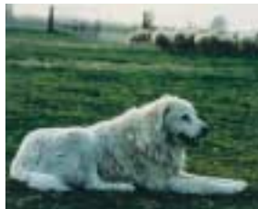
Breeding of the traditional pure breed of Greek Shepherd Dogs and their consequent offer to livestock raisers, helps in the effective guarding of their livestock.