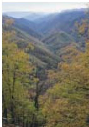
Bear habitat in Rodopi Mts. (mixed oak-beech forest)

The survival of the bear is tied to the survival of the forest. That is why the measures undertaken by the ARCTOS Project aim, among others, to the wider protection and the conservation of the forests and mountain ecosystems in Greece.