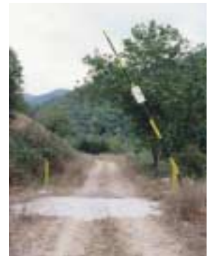
The seasonal closure (with road barriers) of parts of the forest road network helps in the decrease of the uncontrolled vehicle access in critical bear areas.

The ARCTOS Project is in close co-operation with the Forestry Service and Hunting Associations for the elimination of poaching and the information of hunters on how to react in case of encounters with bears in the wild. In critical for the species areas, special measures are taken in order to avoid disturbance or killing of the animals.