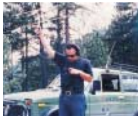
Radio-telemetry is a modern technique implemented in Greece for the first time in the frame of ARCTOS Project offering valuable data on the ecology of the bear.

The destruction, degradation and fragmentation of bear habitat entails the loss of the animal's home range and of the linkage areas between different populations, which are vital for the ecological demands of the species.