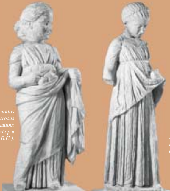
Head of a bear with chiton himation; in the right hand a hare (4th cent. B.C.).