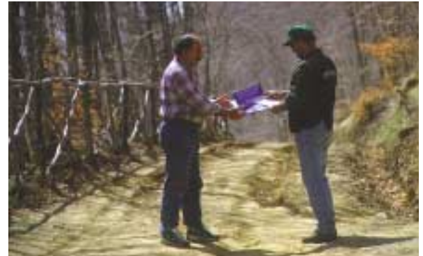
Six Local Assistants of the project are responsible for the direct communication, information and assistance to the farmers (compensation of damages, special problems).

The project planned and implements an awareness raising campaign addressed to specific target groups, with emphasis in the areas within the bear range. The production of printed information material, the regular presence in local and national mass media and the public events and presentations organised, all aim at the awareness and active participation of the public.