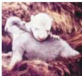
Newly-born bear cubs

Brown bear is the largest terrestrial mammal in Europe, measuring 1.7 - 2 m. in length and weighing 60 - 250 kg., depending on the sex and the season of year. In nature, bears live for approximately 25 years.