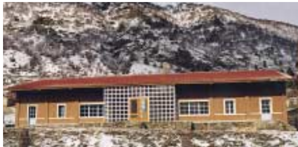
Information Centre for the Brown Bear

More than 30,000 visitors annually and hundreds of volunteers had the opportunity to get informed and participate in various activities at the Centre.