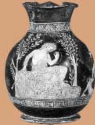
Representation on a red-figure vase of the 4th cent. BC; Callisto watching her hand turning into a bear's paw.

The bear is the continuation of an ancient way of life. It is connected to almost all northern hemisphere civilisations by legends, traditions and stories. An animal with no natural enemies, its only one being Man.