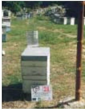
More than 130 electric fencing units have been disposed by the ARCTOS Project for the protection of apiaries. Their setting up was made possible with the assistance of the Forestry Service.

During the last five years the ARCTOS Project scientific team has recorded forty-seven (47) poaching cases of bears caused by humans! Furthermore, there is additional information on other, unconfirmed cases. If the killings continue at the present rate and in addition to the natural mortality of the population, there is high probability that bear population will decline again in Greece.