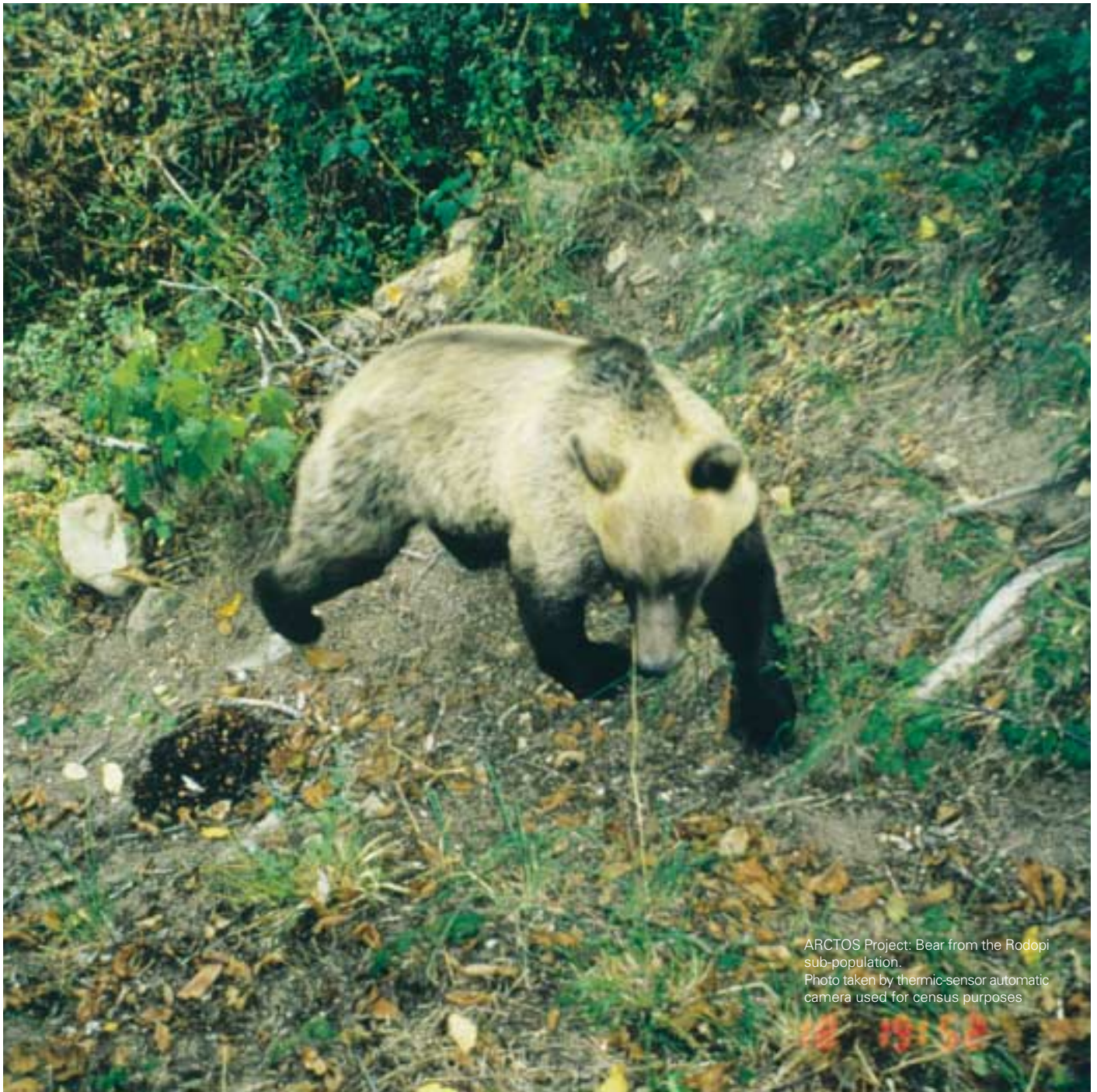
ARCTOS Project: Bear from the Rodopi sub-population. Photo taken by thermic-sensor automatic camera used for census purposes