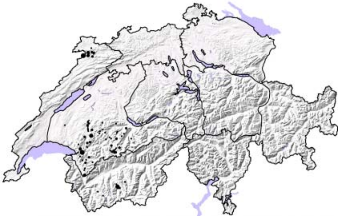
Figure 1: Distribution of livestock (141 sheep, 17 goats, 3 fallow deer) compensated as lynx kills in Switzerland in 2000. The size of the dot represents the number of animals killed per pasture. Smallest dot = 1 sheep; largest dot = 11 sheep. Boundaries = large carnivore management compartments of Switzerland. In Switzerland, about 250,000 sheep are aestivated on mountain pastures.